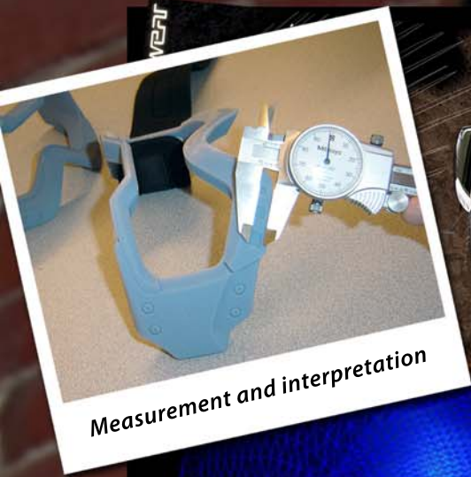
Measurement and interpretation