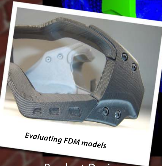
Evaluating FDM models