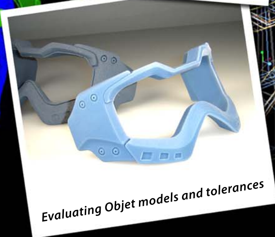
Evaluating Objet models and tolerances

The March 2009 Sneak Peek is the third of our 3-part series on how the Helix Design team generates solutions to your product development needs. In January , we highlighted our "blue-sky" concept generation capabilities in two dimensions. In February , we put our team's hand modeling skills front and center to show off how we refine product ergonomics prior to CAD generation. This month, we talk about how we ideate and solve mechanical problems in CAD.